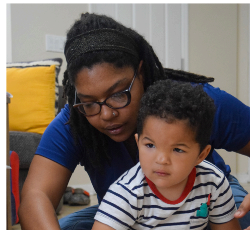
The PLAY Project for Children with Autism

Easterseals Florida (813) 236-5589 www.easterseals.com/florida