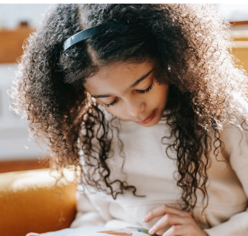
The Incredible Years® Group Mental Health for Children