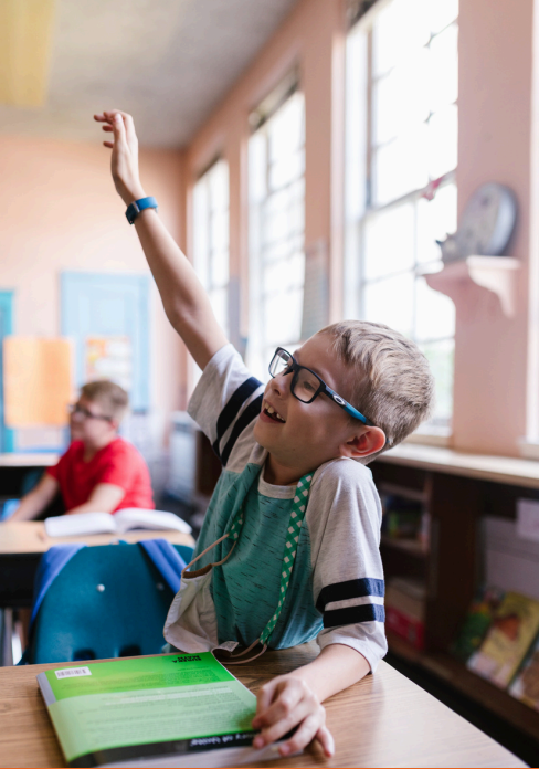
Easterseals School for Limitless Learning

Easterseals Florida's purpose is to lead the way to 100% equity, inclusion, and access for people with disabilities, families and communities.