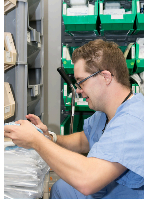
STRIVE Workforce Development Training