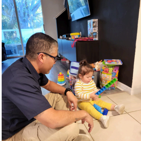
Early Learning and Intervention Program (ELIP)